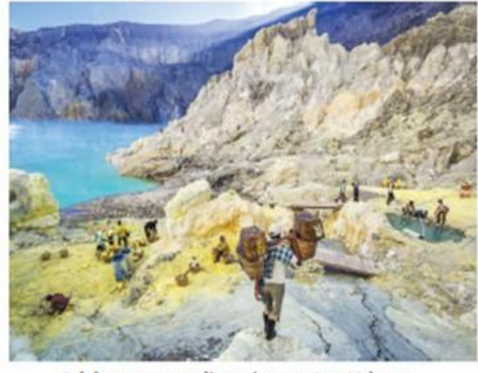
Sulphur miners walking down to Iten Volcano

In the very early morning we shall commence our hike up to Mount Ijen to its spectacular sulphur crater lake and to experience the unworldly sight of its "blue fire" phenomenon. Walk past Indonesian sulphur miners as they walk down the slopes with their heavy quarry. The hike will take approximately 1\frac{1}{2}-2\frac{1}{2} hours depending on physical fitness. After descending from Mount Ijen we will have breakfast at the hotel before departing via ferry for Menjagan in the West Bali National Park and check into the Mimpi Resort Menjagan.