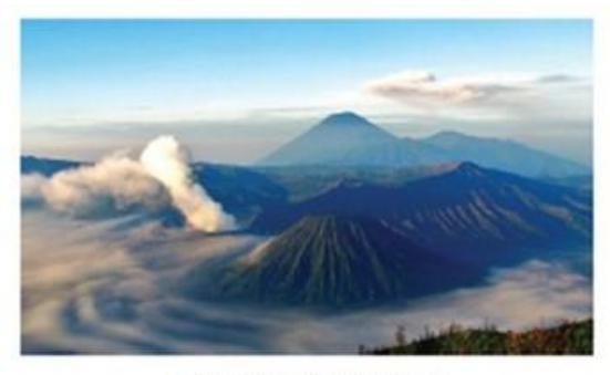
Iconic view of Mount Bromo

On the way to Bayuwangi we shall visit a coffee plantation in Kalibaru. The picturesque road from Jember to Banyuwangi winds around the foothills of Gunung Raung through rainforest and up to the small hill town of Kalibaru (428 m). Java coffee beans are world famous and synonymous with coffee. The trip between Bromo and Bayuwangi takes approximately six hours. After arrival in Bayuwangi we check into the Santika Bayuwangi Hotel to get some needed rest after dinner.